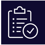
Figure 1. ASC approach to the National Principles for Child Safe Organisations

The ASC is focused on fully embedding the National Principles for Child Safe Organisations and being a leader for child safeguarding. In 2022-23, we achieved best practice implementation across a number of principles. Figure 1 below outlines our approach.